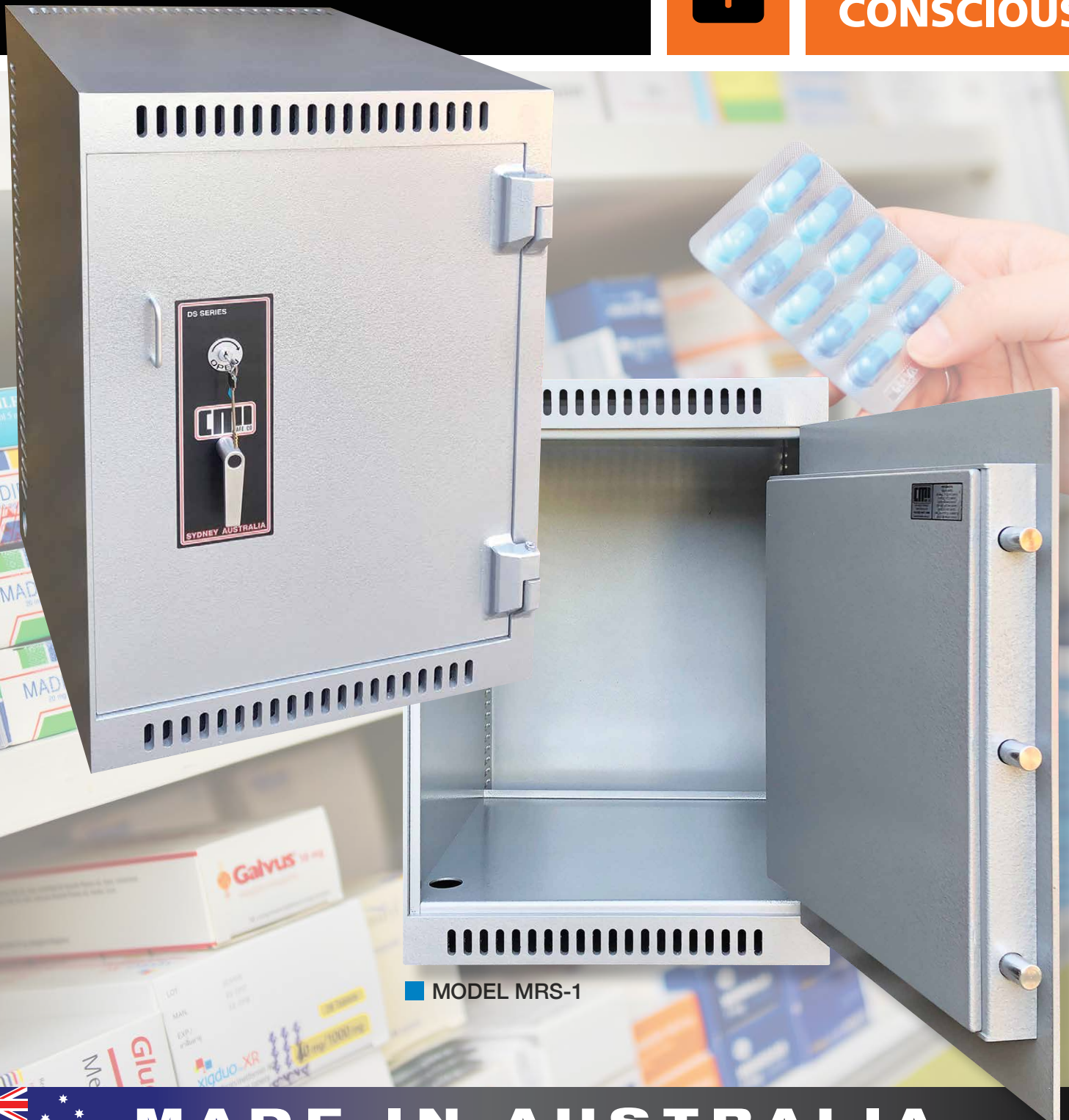
■ MODEL MRS-1